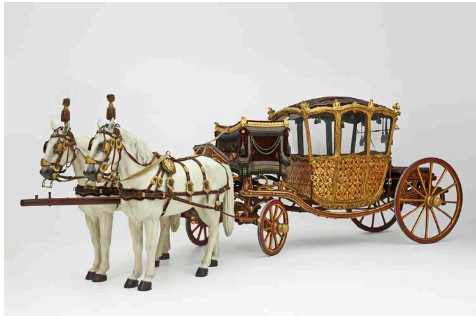
Prince’s Dress Carriage, c. 1750/55; wood, gold, braids, metal, leather, velvet, glass; Kunsthistorisches Museum Wien

“The Habsburgs: Rarely Seen Masterpieces from Europe’s Greatest Dynasty” chronicles the Habsburgs’ story in three chapters, each featuring a three-dimensional “tableau”—a display of objects from the Habsburgs’ opulent court ceremonies—as context for the other works on view.