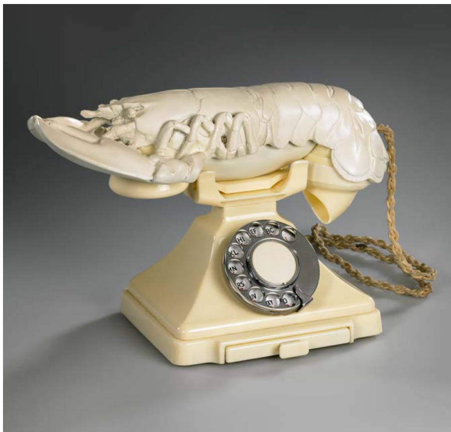
Salvador Dalí, Aphrodisiac Telephone, 1938, The William Hood Dunwoody Fund