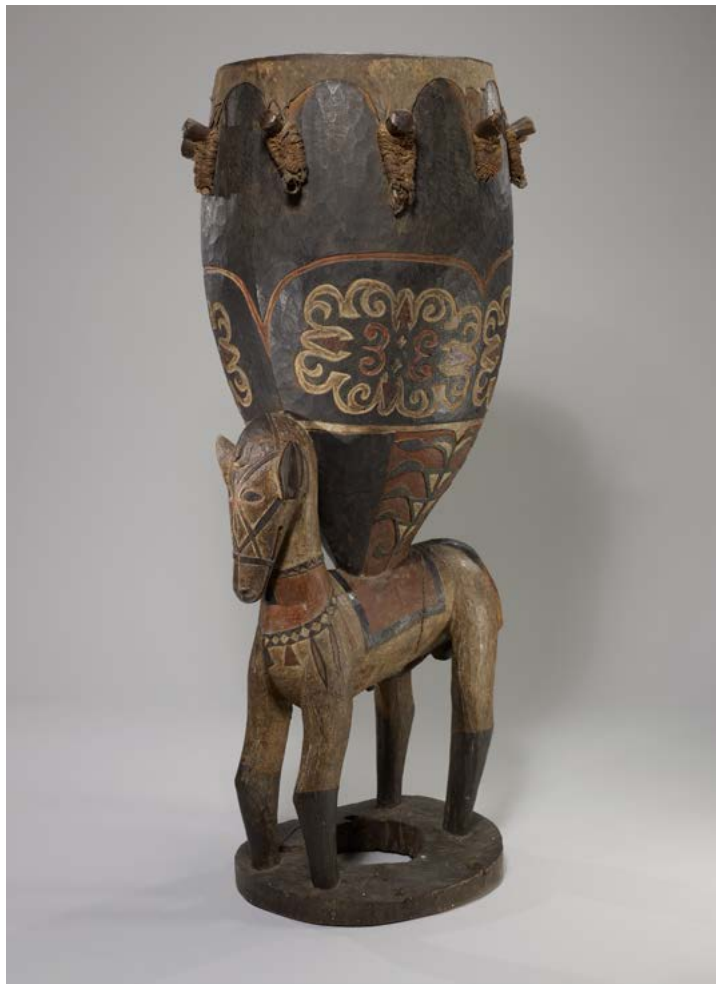
Baga, Guinea, Africa, Drum, early 20th century, The William Hood Dunwoody Fund