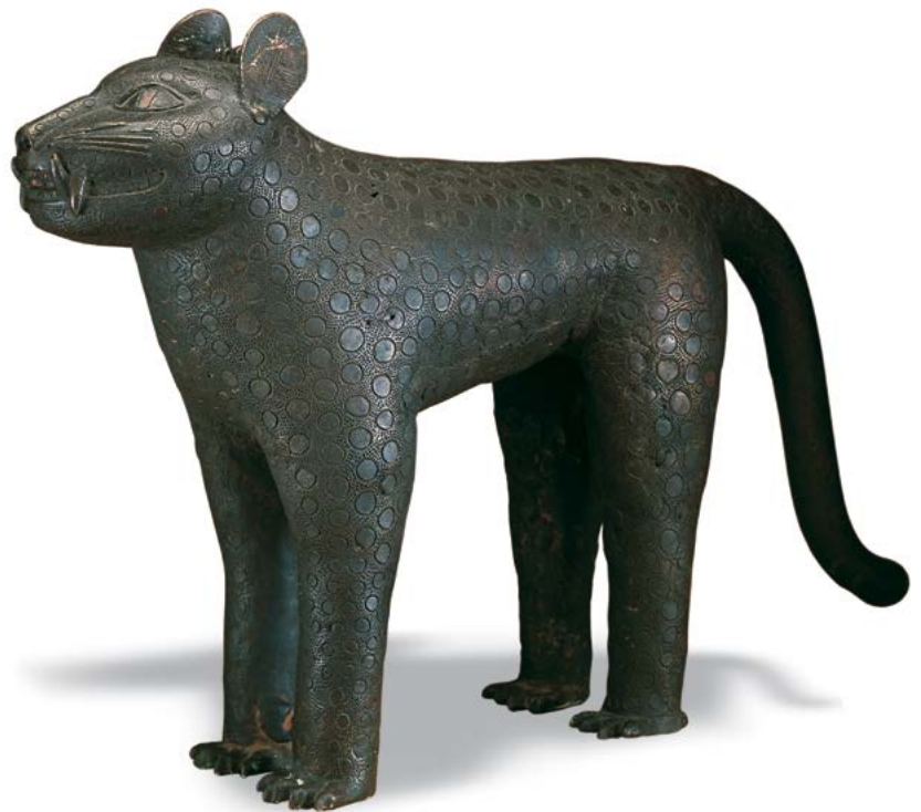
Benin, West Africa, Water pitcher, 18th century, bronze, The Miscellaneous Works of Art Purchase Fund