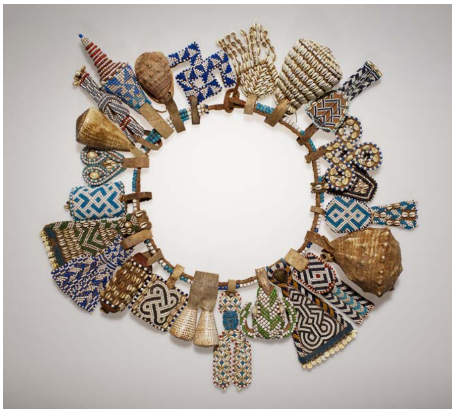
Kuba, Royal belt, Democratic Republic of Congo, Africa), mid-20th century, The Ethel Morrison Van Derlip Fund