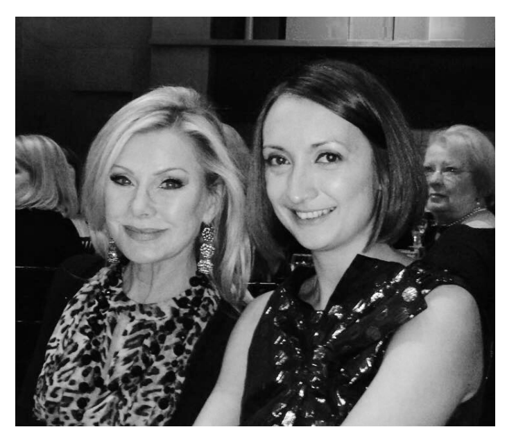
Salon guests enjoying dinner.